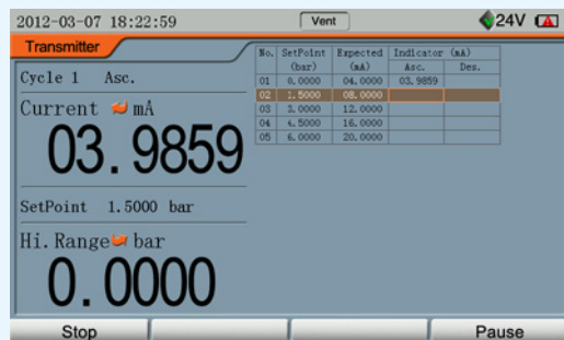
Pressure gauge / transmitter / switch calibration