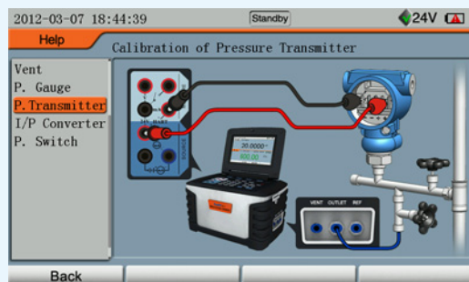
Built-in User's Manual