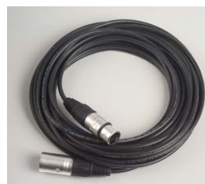
Extension cable XLR, GA-01005