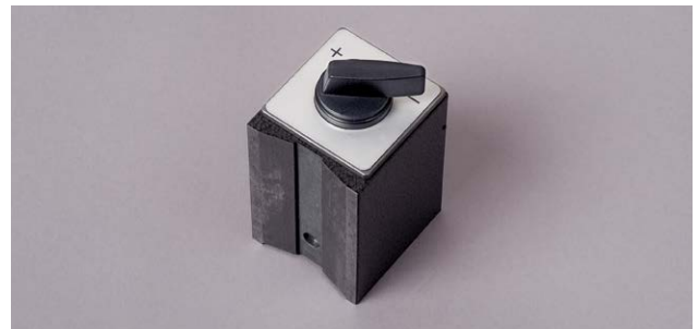
Switch magnetic base