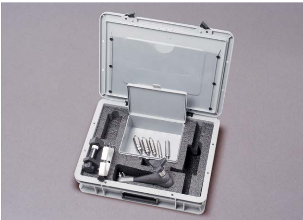
Rotary transducer mounting kit