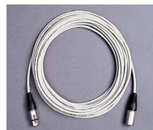
Extension cable XL, GA-00150