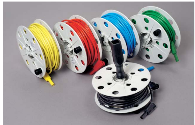
Cable reels, 20 m (65.5 ft), 4 mm stack-able safety plugs