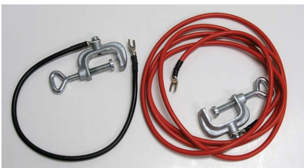
Current cables for SDRM201, the red cable is 3.0 m (9.8 ft) and the black one is 0.5 m (1.6 ft)