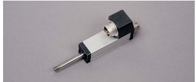
Linear transducer, TS 25