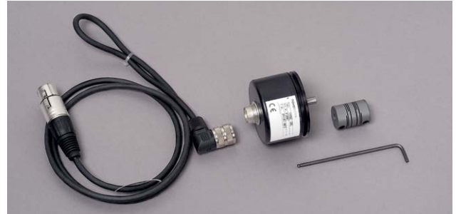
Rotary transducer, Novotechnic IP6501 (analog)