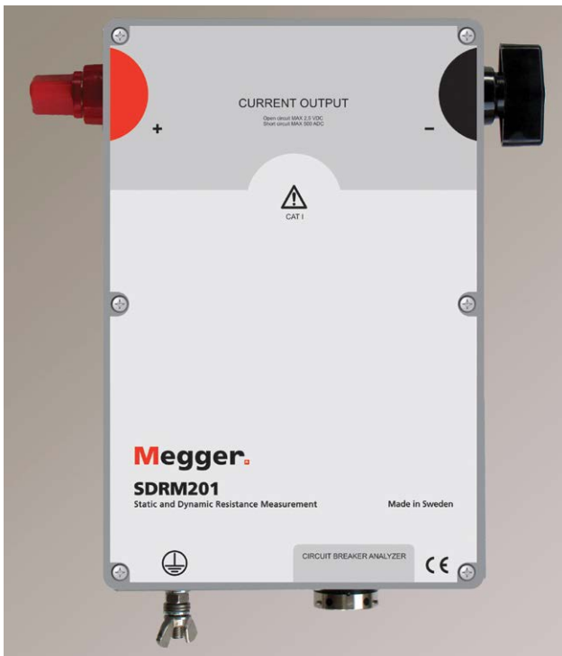
The SDRM201 is intended to use for both static and dynamic resistance measurements (SRM and DRM) on high voltage circuit breakers or other low resistive devices