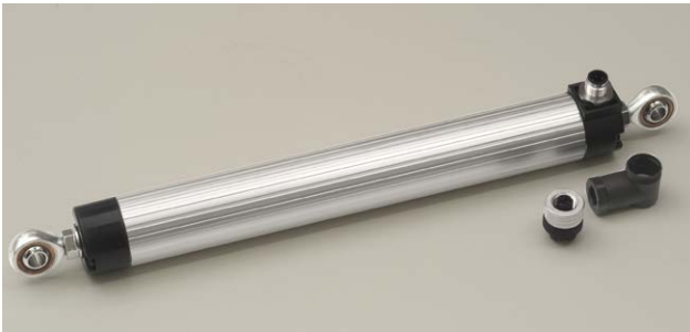
Linear transducer, LWG 150