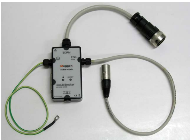
The SDRM Cable