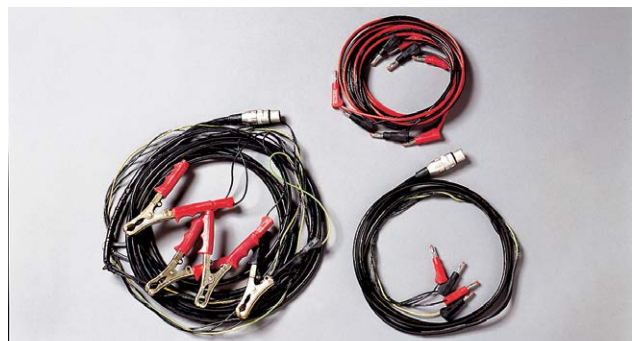
Multicable sets GA-00160 and GA-00170 and cable set GA-00082