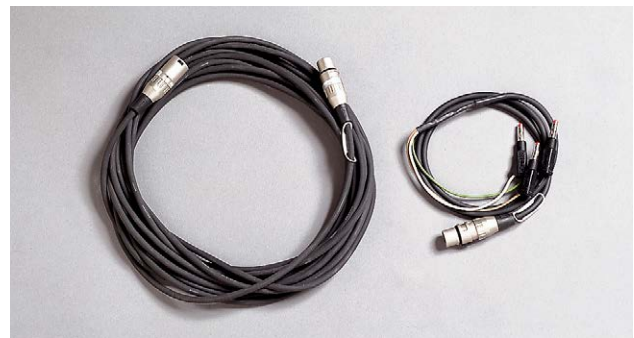
Transducer cables GA-00041 and GA-00042