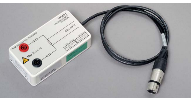
Voltage divider, VD401