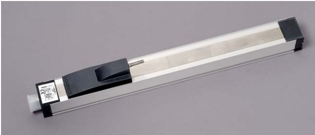
Linear transducer, TLH 225