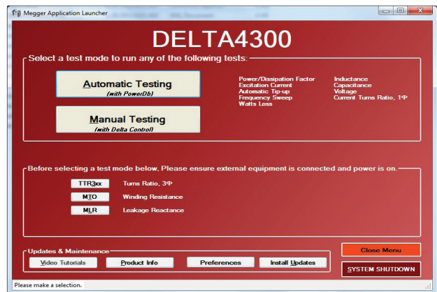
DELTA4310 OnBoard computer screen