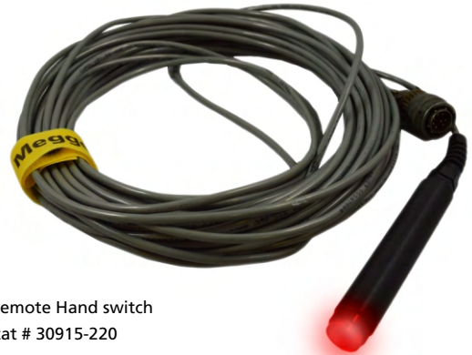
remote Hand switch cat # 30915-220