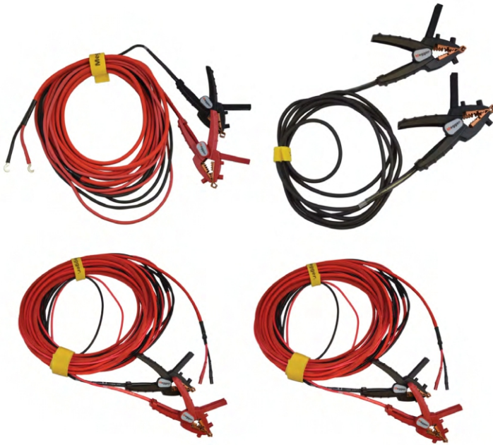
Lead set, 60 ft (18 m) [ 500 kV]. Also available in 30 ft (9 m) and 100 ft (30 m) cat # 1004-641