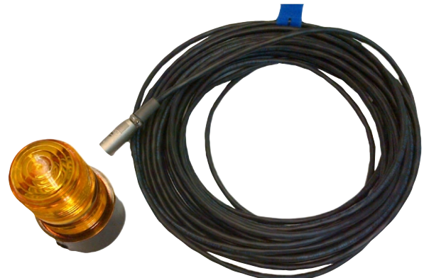
HV Strobe and Leads Cat # 1004-639 Length: 60 ft ( 18 m) Weight: 2.3 lb (1.1 kg)